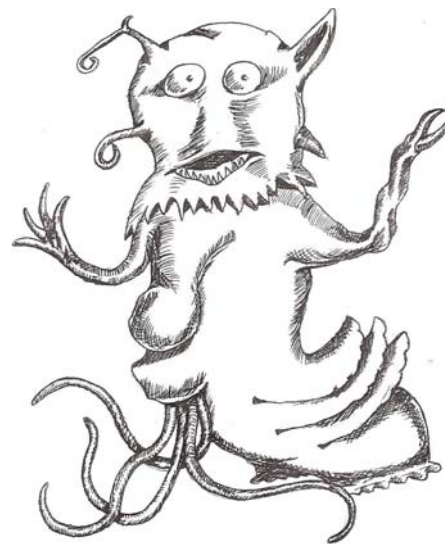
Drawing by Fred Leary. Used with permission.